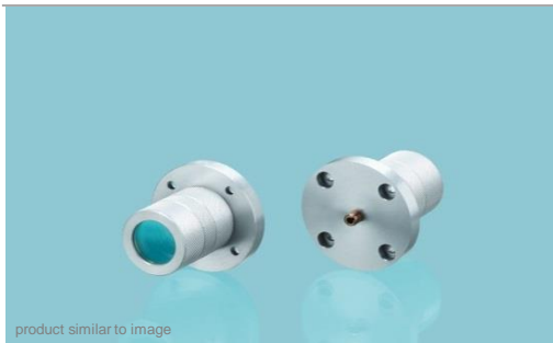
product similar to image

Laser Process Head for advanced Material Processing