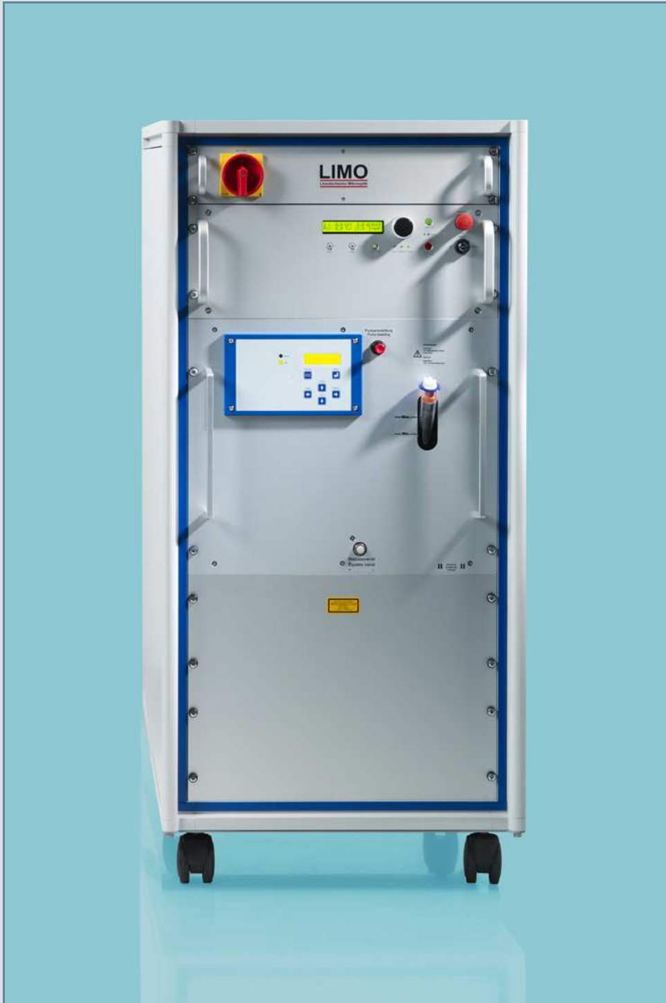
40 Bar Industrial Laser System with chiller and power supply in a 23 HU high 19"-Rack

LIMO Lissotschenko Mikrooptik GmbH Bookenburgweg 4-8 • 44319 Dortmund • Germany Phone +49-231-22241-300 • Fax +49-231-22241-301 • www.limo.de • sales@limo.de