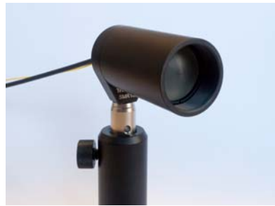
CTLF-D25mm mounted with SMR1 (rear side threaded)