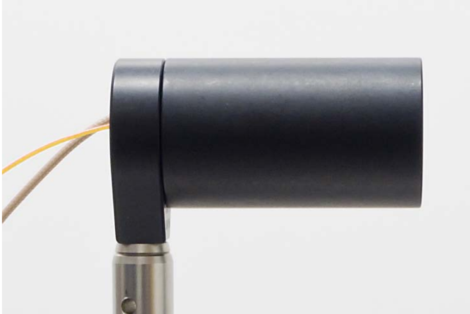
Fig. 2: CTLF-D25mm mounted on SMR1 - side view

needs to point towards the front side (laser or chip side) of the PCA. Further the PCA needs to be equipped with one of BATOP's hyperhemispherical silicon substrate lenses.