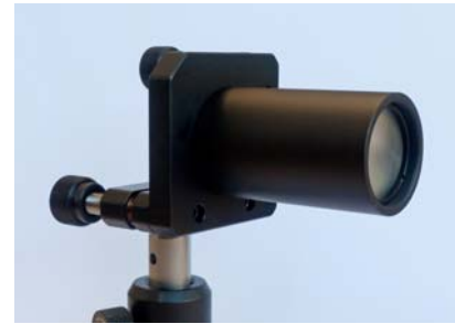
CTLF-D25mm mounted with KM100T