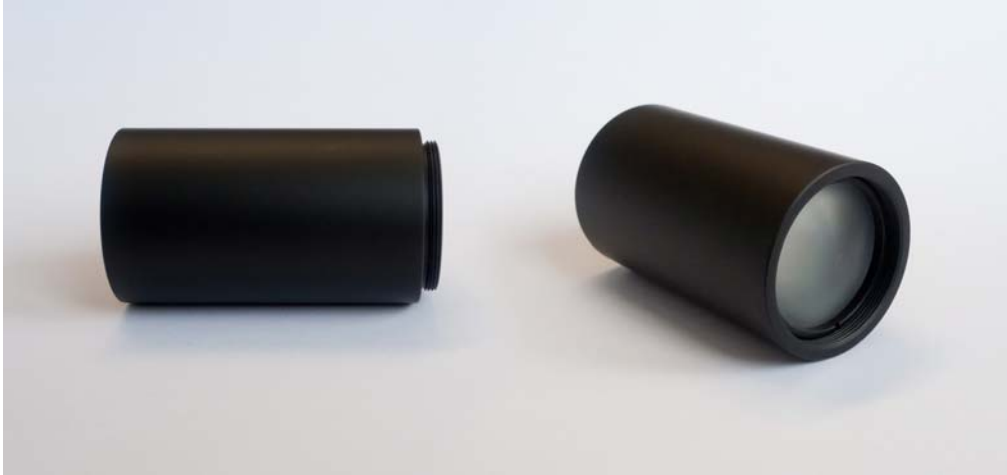
Fig. 1: CTLF-25mm