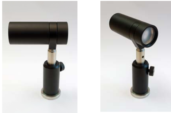
Fig. 6: CTLF-D25mm and FTL-f30mm mounted with SMR1

An additional second TPX lens FTL-f30mm with 30 mm focus length can be mounted on the CTLF-25mm to get a THz focus. Please refer to data sheet for FTL-f30mm for further information.