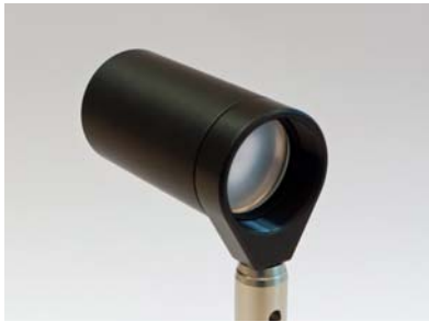
CTLF-D25mm mounted with SMR1 (front side threaded)

The Lens Tube's SM1 thread allows it to be attached to multiple standard parts equipped with the same thread. It is possible to mount both lens and FC-PCA either with the tube's thread oriented towards the front side, where the radiation is emitted or received, or towards the back side, where fiber and electrical cables exit the antenna module. We recommend using Thorlab's SMR1 as a static mounting solution. Tilting the antenna is possible when Thorlabs's KM100T is used.